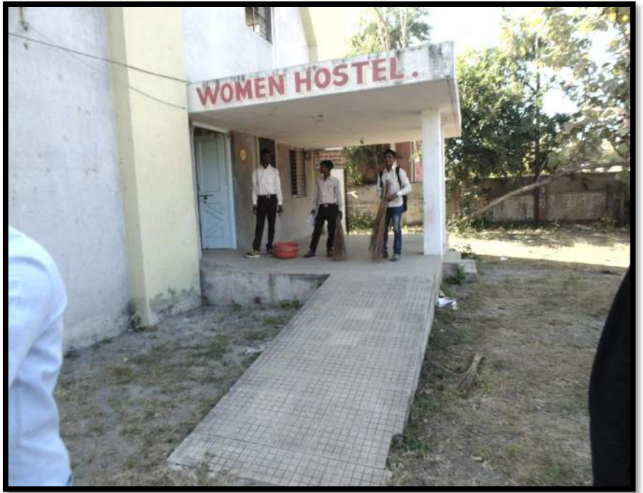
Shri Shivaji Education Society, Amravati's Y.D.V.D. Arts, Commerce College, Teosa. Dist-Amravati